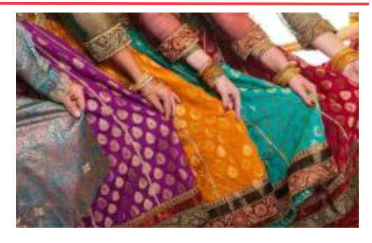
Day 16 - 17: Depart Delhi

After breakfast, transfer approximately 06 hrs back to Delhi and check-in to your hotel upon arrival. This evening, sit down to a farewell dinner.